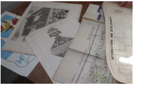
Map, Print and Picture Auction. A medley of local and not so local work will be for sale, with an enthusiastic auctioneer, your very own curator!