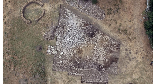
An aerial view of the site showing the paving

Interest is focusing on the complex construction of the site and the lay out which has obviously been carefully thought through, using the natural ridge to the west, nestling below a rocky outcrop on the north and a glacial mound to the east. Although the site is on a steep slope, this has been engineered into terraced platforms and flagged yards, with possible evidence of later redevelopment in the form of better laid flags and some aesthetic features.