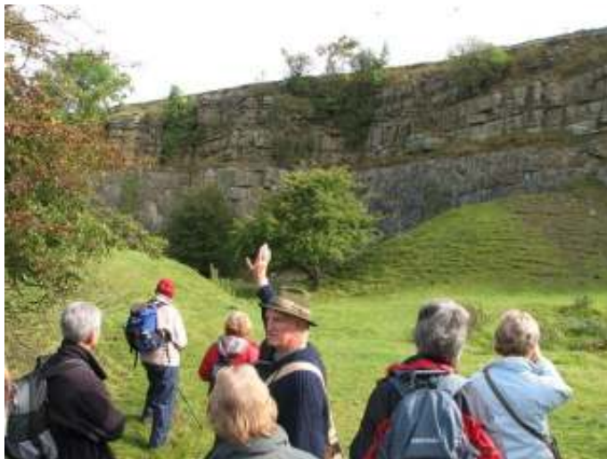
Admiring the rock strata in Downholme Quarry

The main feature, previously unknown to me, which Tim has revealed throughout Swaledale & Wensleydale, is that of the 'Burnt Mound'. There are hundreds of these low mounds of burnt cracked stones, which have been heated to very high temperatures. They usually occur in pairs ranging from about 4 - 15m in diameter, or form a horseshoe shape and are always near a water course or if not, you can see where there would have been one at one time. A trough to hold water is usually excavated between the mounds or within the horse shoe. There have been no remains of pots or bones found at these sites so they were not used for cooking. Tim's theory, (and this is where Tim & I differ on interpretation) is that the male elders of the