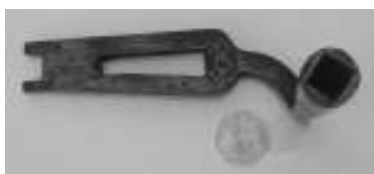
The bed spring tightener

Last edition's object ( below ) was a bed spring tightener - honestly! Something to appreciate when you sink into your low maintenance divan tonight!