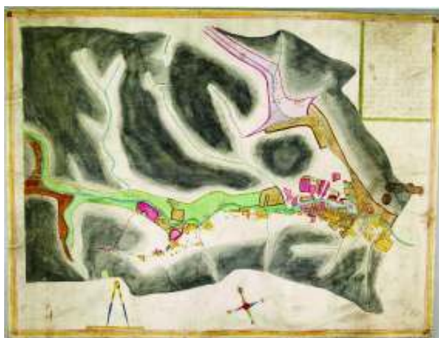
The Oldest known Map of Swaledale