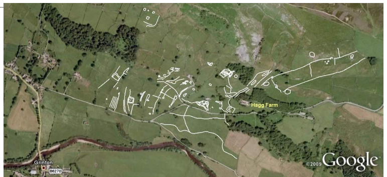
Aerial photo of West Hagg site with boundaries superimposed