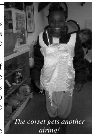
The corset gets another airing!

Several members of the Friends also belong to other local groups & send us details of their own events in the area which we circulate with the email updates. We've asked some of them to introduce themselves & tell us about what they do: