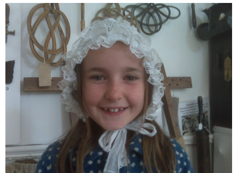
Janet's granddaughter in one of the bonnets