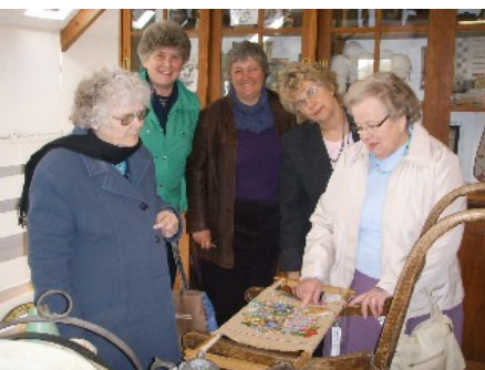
Members of Fearby & Healey WI enjoying an afternoon in the Museum