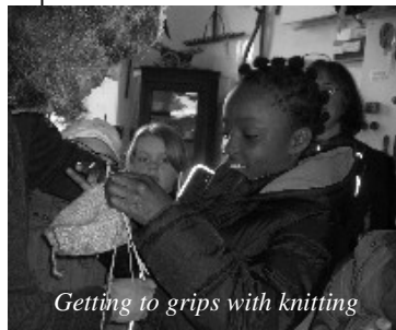
Getting to grips with knitting