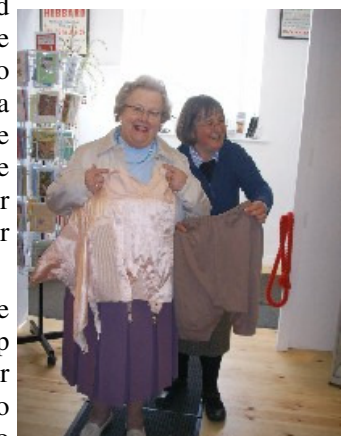
The vintage underwear collection is always popular!